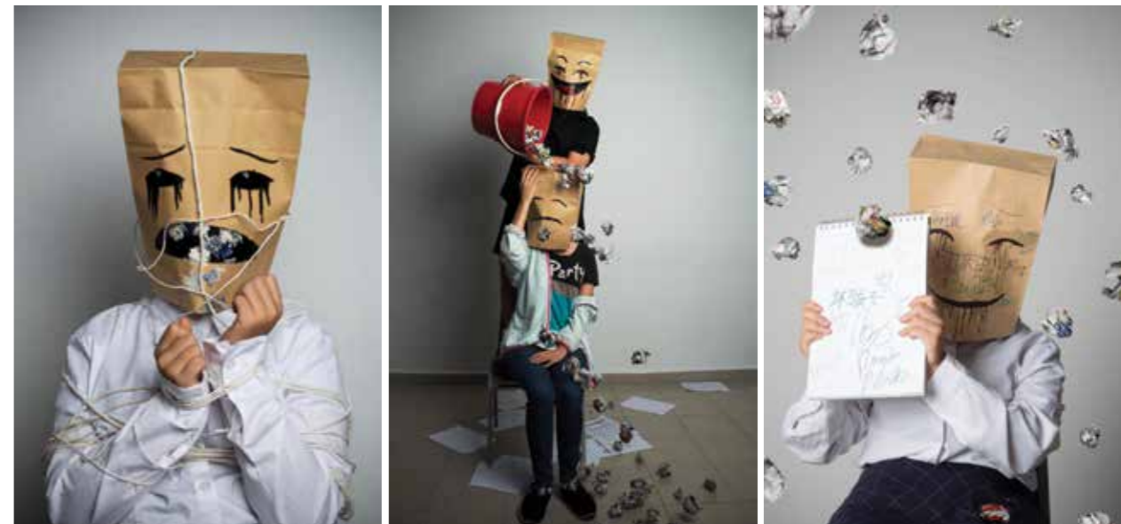
LIM SHU SENN

Growth to be Strong Digital print on art card 59.4 x 84.1 cm 2019