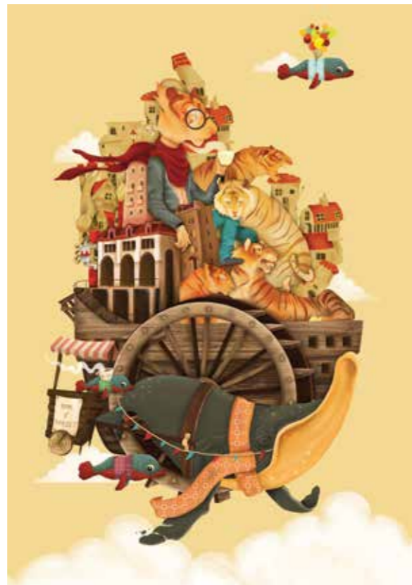
CHONG KAI QI

Big Cat Digital print on art card 84.1 x 59.4 cm 2019