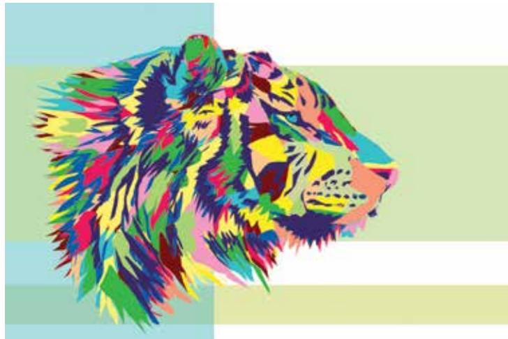
JIVARASAN CHANDRASEGRAN WPAP Digital print on art card 59.4 x 84.1 cm 2019