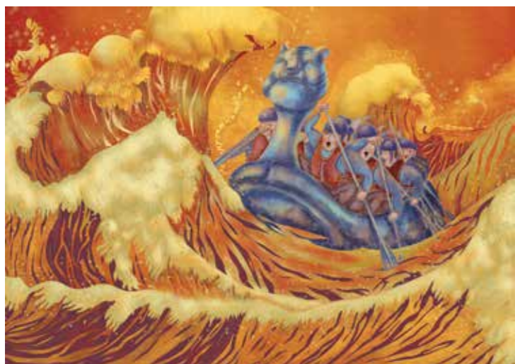
LO YEN YEN Come on Guys, It's Just a Wave Digital print on art card 59.4 x 84.1 cm 2019