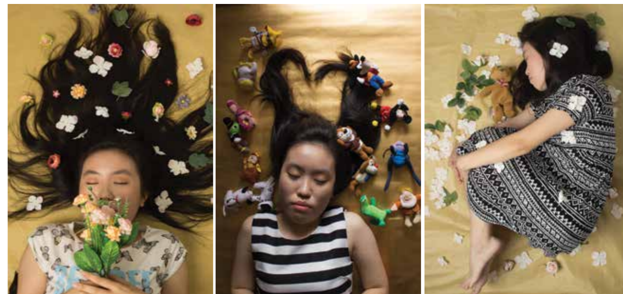
TSE TSZ CHING

Growth to be Strong Digital print on art card 59.4 x 84.1 cm 2019