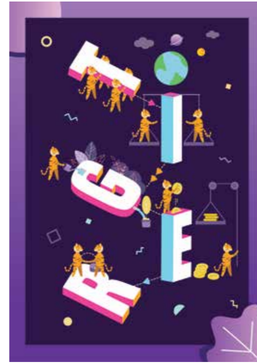
FOONG ERN HUEI

Tiger I Teamwork Digital print on art card 59.4 x 84.1 cm 2019