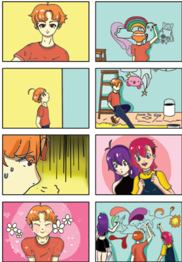
ERNI NUR ZULAIKHA ZAINAL

Teamwork Among Friends Digital print on art card 84.1 x 59.4 cm 2019