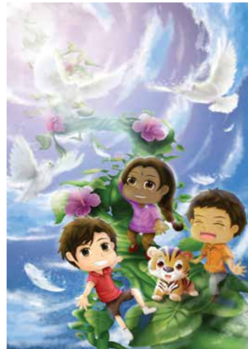
TEE HUI YEE

Precious Digital print on art card 59.4 x 84.1 cm 2019