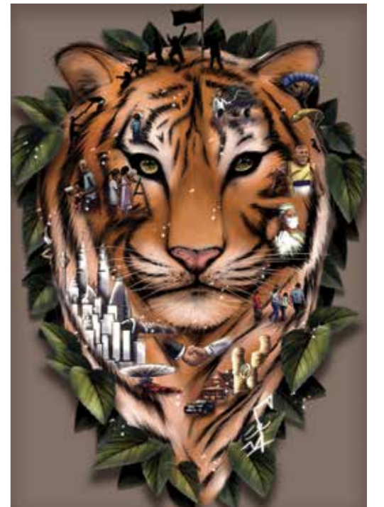
MOHAMMAD NOR ANWAR HUSSIN

The Beanstalk Digital print on art card 59.4 x 84.1 cm 2019