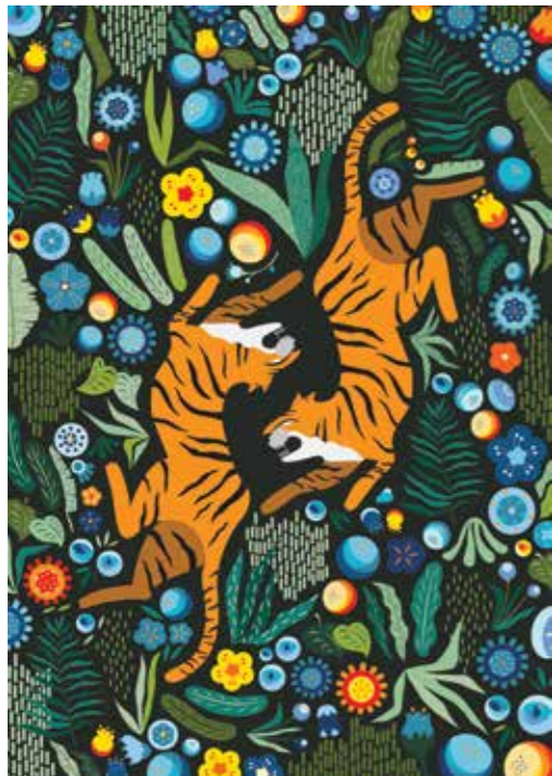
DING XIN NING

Variety Digital print on art card 59.4 x 84.1 cm 2019