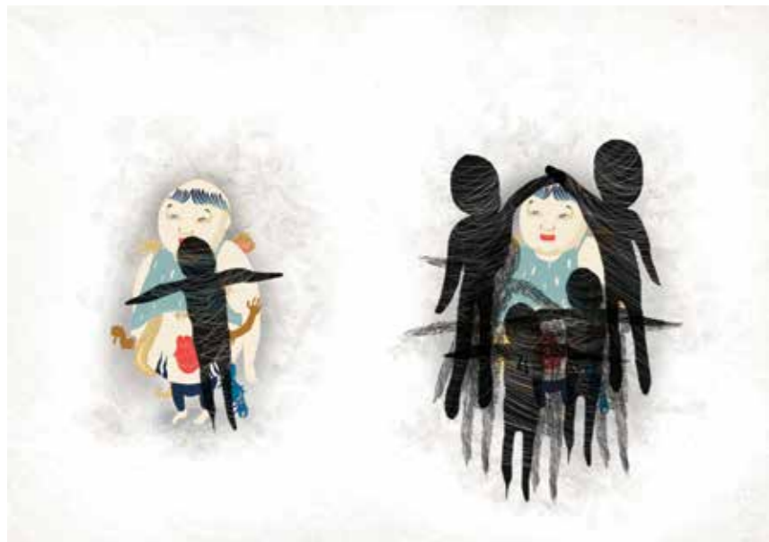
LO YEN YEN

Pembangunan Malaysia Digital print on art card 84.1 x 59.4 cm 2019