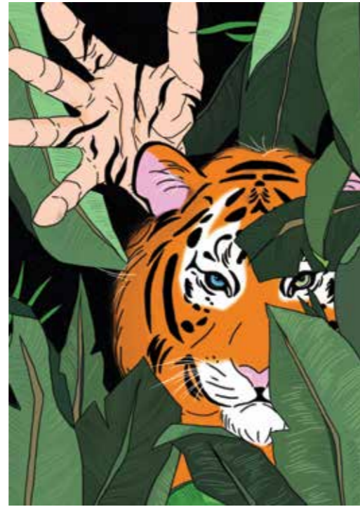
LAI JING NI

Growth Together Digital print on art card 59.4 x 84.1 cm 2019