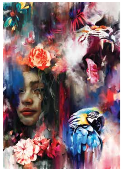
MOHD SAIFUL MAZLAN

Paying It Forward Digital print on art card 59.4 x 84.1 cm 2019