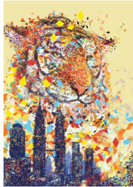
CHONG YAW WEN

G is for Growth Digital print on art card 59.4 x 84.1 cm 2019