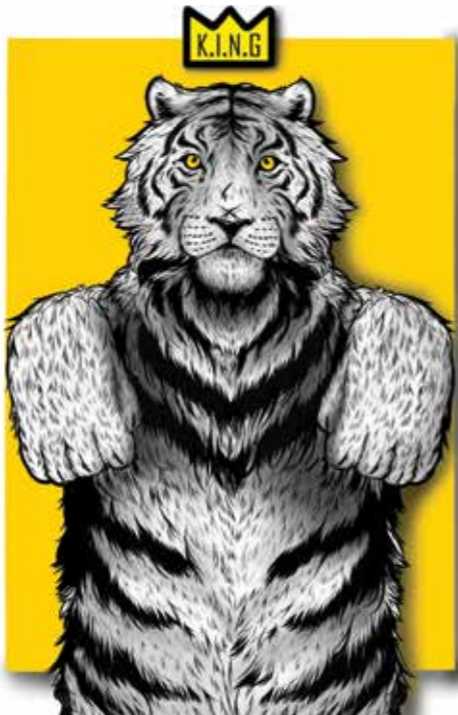
TANG AI SING

The Dancing Tiger Digital print on art card 59.4 x 84.1 cm 2019