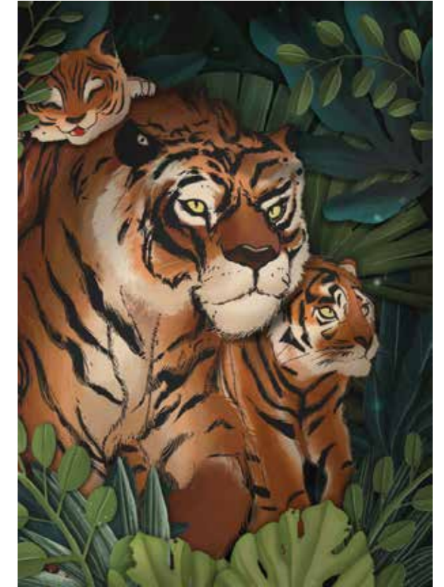
WONG CHU SIONG

Eternal Growth Digital print on art card 84.1 x 59.4 cm 2019