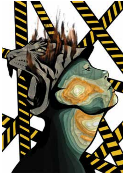
HAIKAL AZIZI ABU BAKAR

Tiger Dance Digital print on art card 59.4 x 84.1 cm 2019