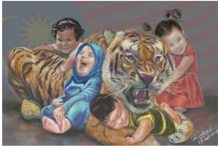
CHUA ROCK YEE Harmony Digital print on art card 59.4 x 84.1 cm 2019