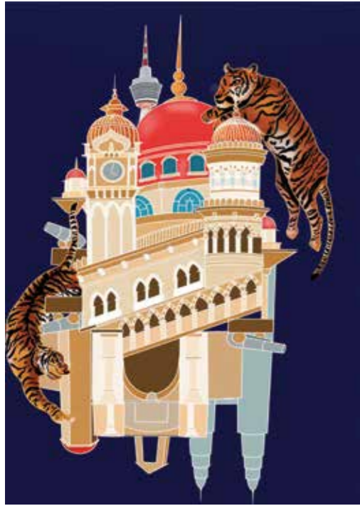
CHAW WEN CHING

Relationship Building Digital print on art card 59.4 x 84.1 cm 2019