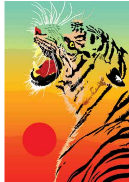
MOHD AQIM MOHD ADIL

Be Who You Are Digital print on art card 59.4 x 84.1 cm 2019