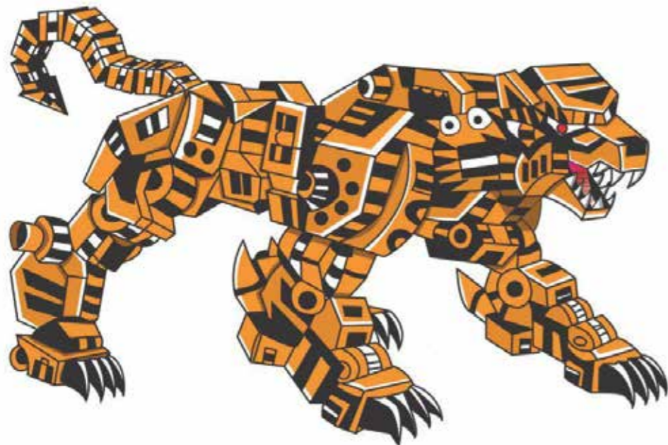
LIM KHAI SHIEN

The Woods Digital print on art card 84.1 x 59.4 cm 2019