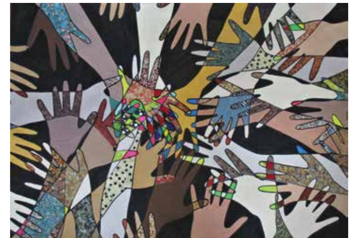
RANA YAACOUB Esprit De Corps Digital print on art card 59.4 x 84.1 cm 2019