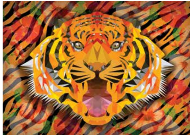
SYED AZAMUDDEN SYED AHMAD TARMIZI

Dalam Kesatuan Ada Kekuatan Digital print on art card 59.4 x 84.1 cm 2019