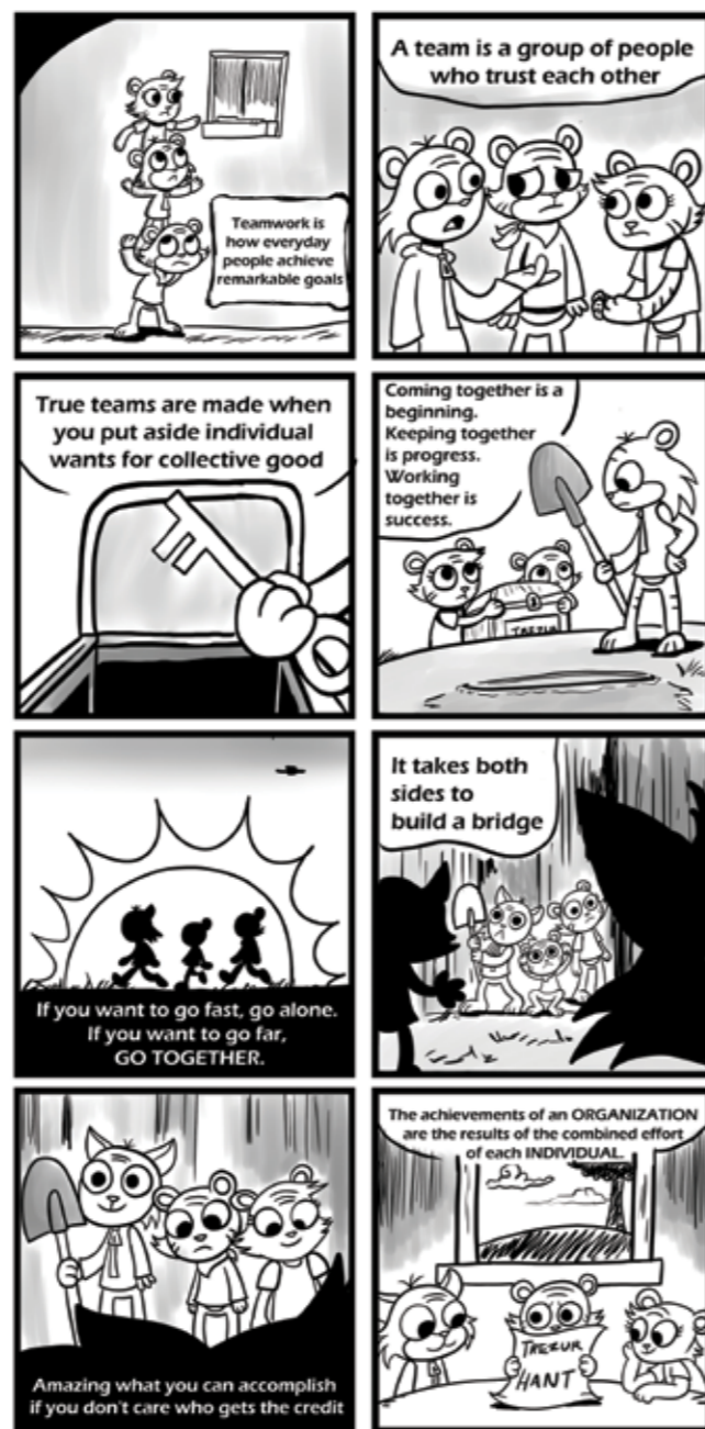
WAN RYZAL ADLY WAN ABU BAKAR

The Bedtime Guardians Digital print on art card 84.1 x 59.4 cm 2019