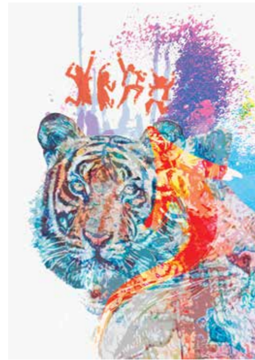
MUHAMMAD AKIF MUHAMMAD AZMI

The Nonchalant Tragedy Digital print on art card 59.4 x 84.1 cm 2019