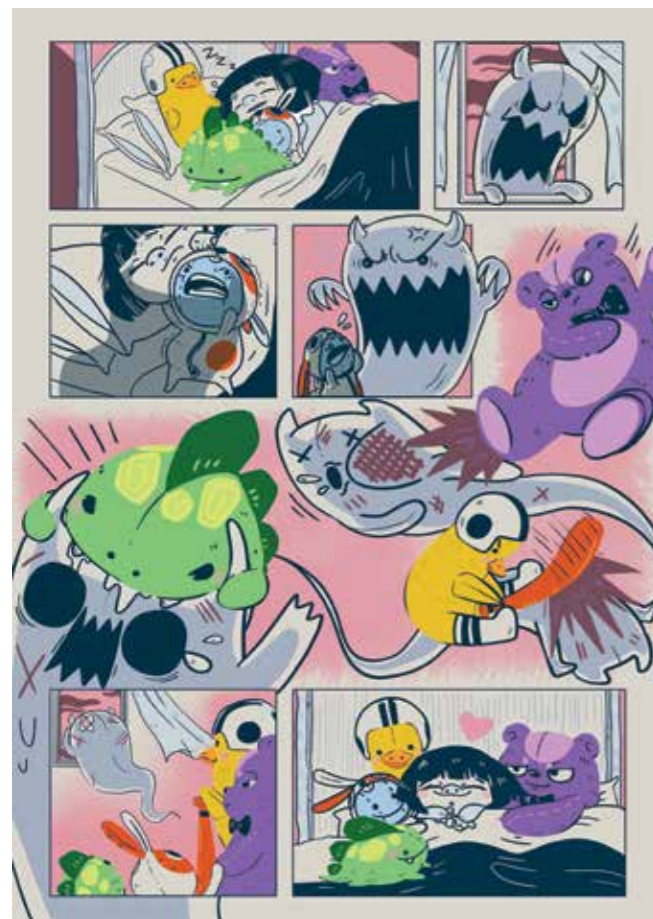
HEW ZHAO XUAN

The Bedtime Guardians Digital print on art card 84.1 x 59.4 cm 2019