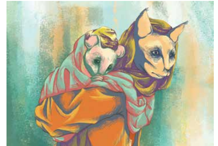
NUR SABRINA AHMAD Perbezaan Adalah Kekuatan Digital print on art card 59.4 x 84.1 cm 2019