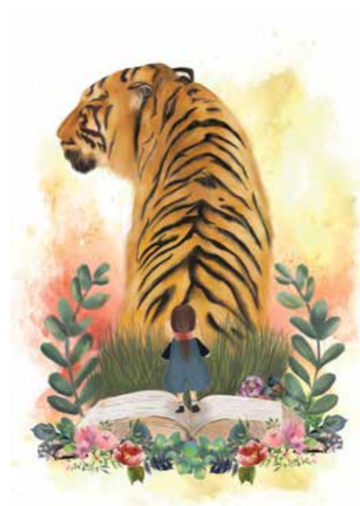
KOID YAN XIN

Secret Behind Growth Digital print on art card 59.4 x 84.1 cm 2019