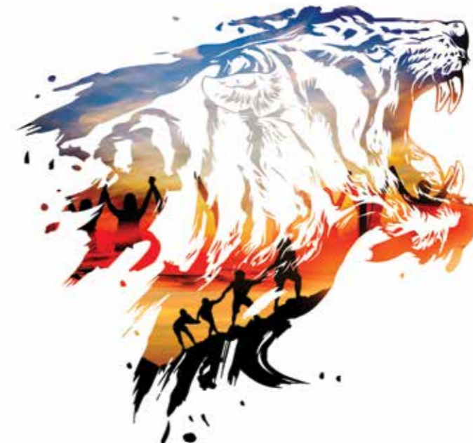
NAFIL AFNAN LOKMAN

Mech Tiger Digital print on art card 59.4 x 84.1 cm 2019