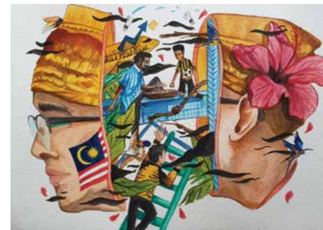
KOK JIN JUE

Tiger and Striped Tiger Digital print on art card 59.4 x 84.1 cm 2019