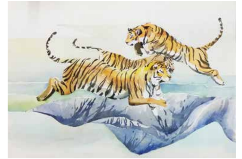
SIM LI MEI

Strength of TIGER Digital print on art card 59.4 x 84.1 cm 2019