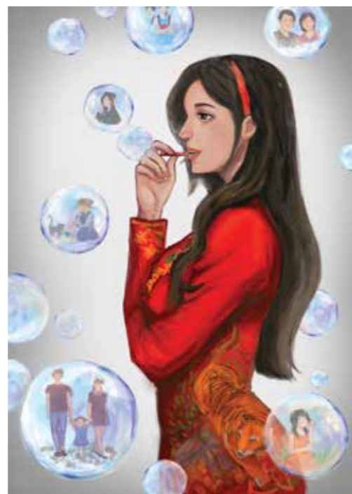
ONG KAR YAN

Human, Flora and Fauna Digital print on art card 59.4 x 84.1 cm 2019