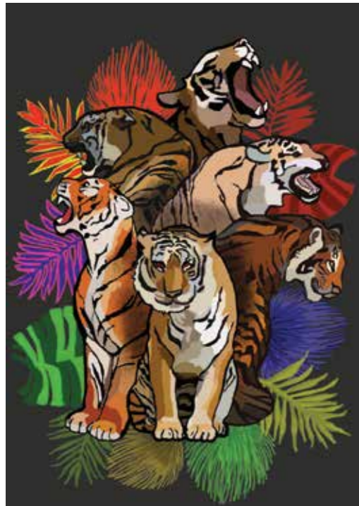
UMMI SYAMIMI ABDUL GHAFAR

Return of the Roar Digital print on art card 59.4 x 84.1 cm 2019