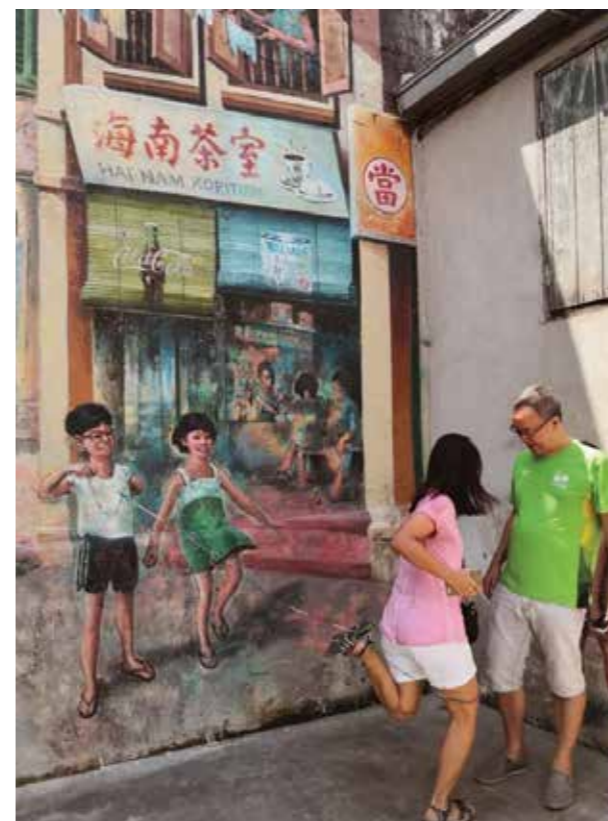
HEW ZHAO XUAN

Efficient Work Digital print on art card 59.4 x 84.1 cm 2019