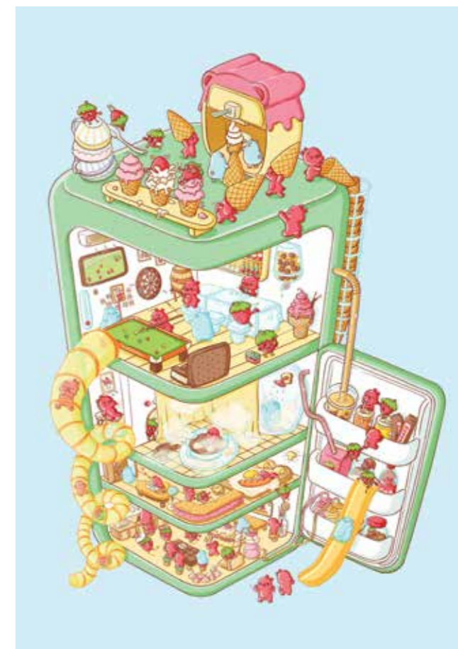
WONG WENG YEE

Unexpected Digital print on art card 84.1 x 59.4 cm 2019