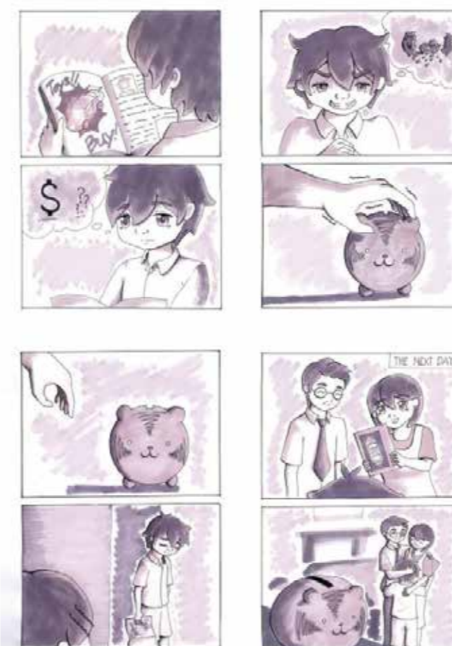
CHONG CHI EN

Teamwork Digital print on art card 84.1 x 59.4 cm 2019