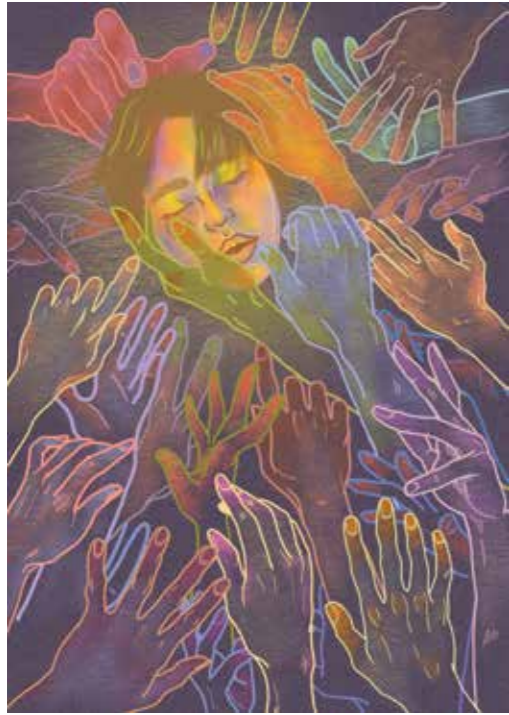
HAJAR NADHIRAH ONN

Village Digital print on art card 59.4 x 84.1 cm 2019