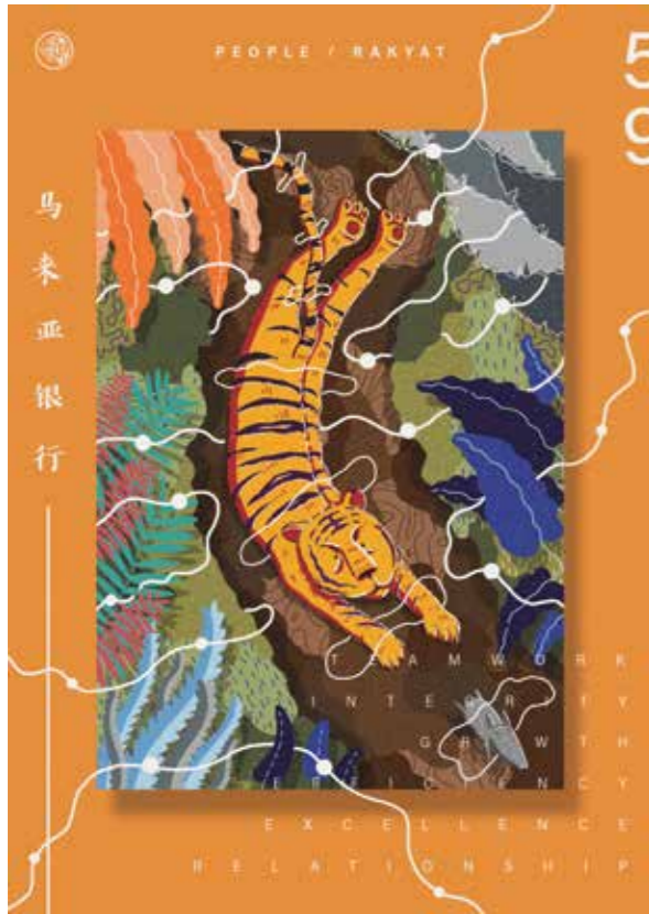
SEE EK CHANG

Big Cat Digital print on art card 84.1 x 59.4 cm 2019