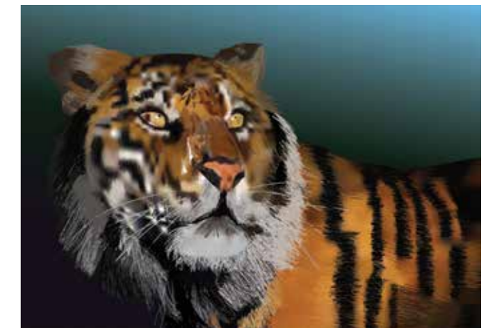
HO KAH HEAN

The Mind of Innovation & Improvement Digital print on art card 59.4 x 84.1 cm 2019