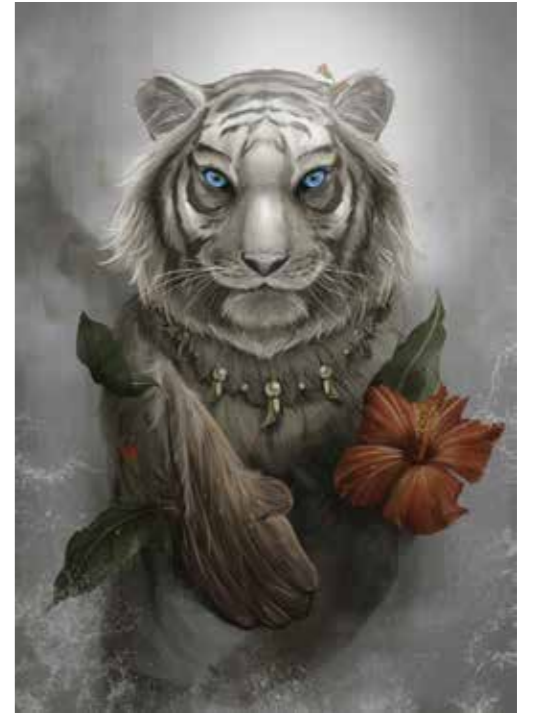
LIEW WAN QIN

Evolve Digital print on art card 59.4 x 84.1 cm 2019