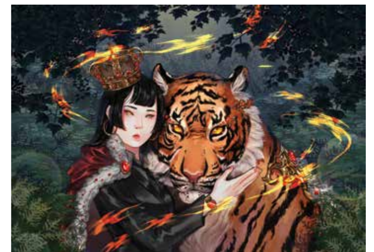
FEBIOLA MATHOVANNY TENGGU Leading the Path Digital print on art card 59.4 x 84.1 cm 2019