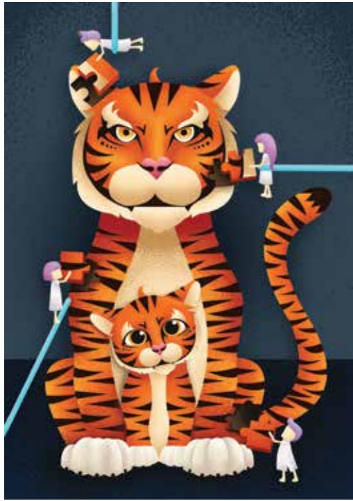
LAM JIN HOWE

Growth Together Digital print on art card 59.4 x 84.1 cm 2019