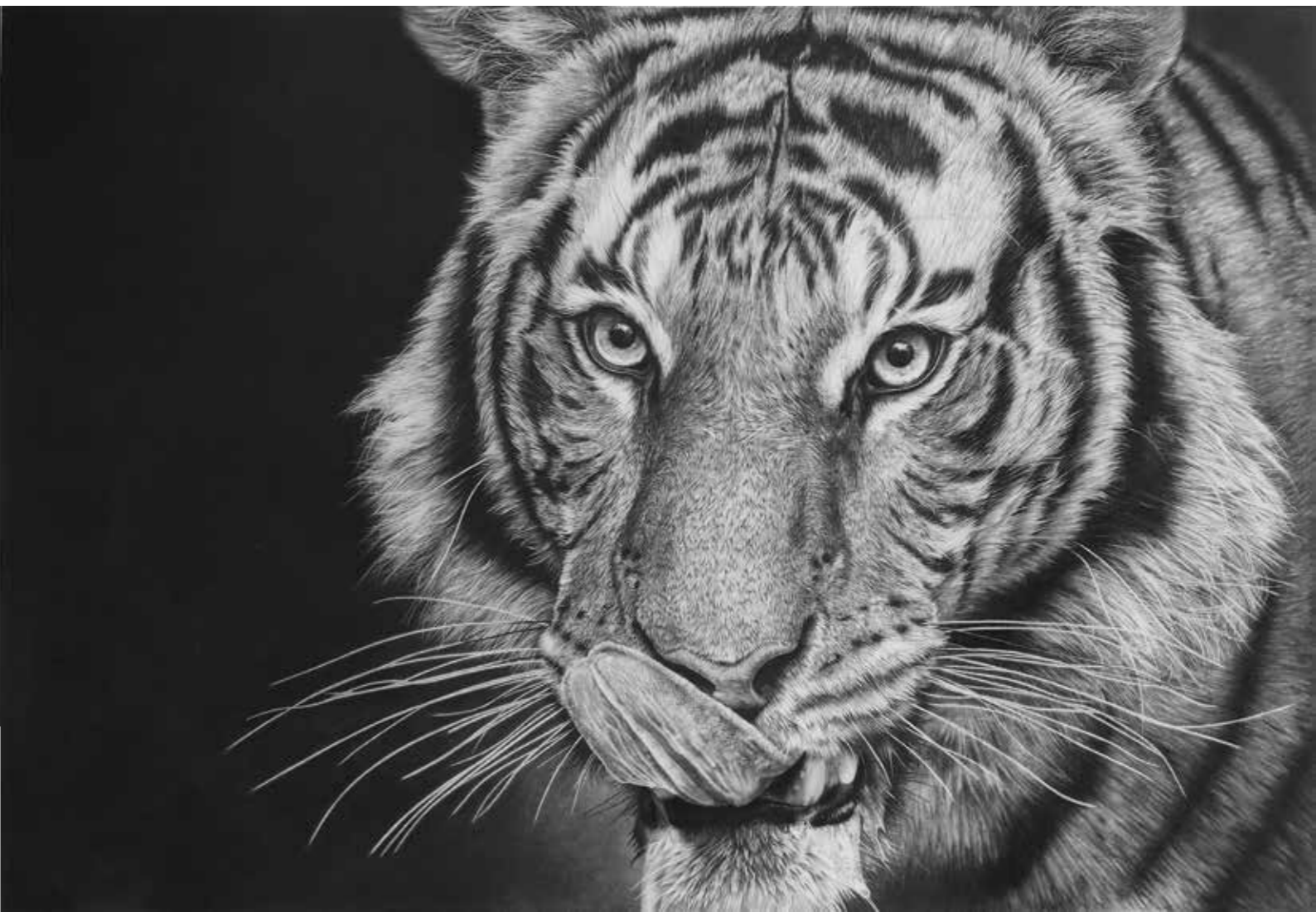
Connor Graphite pencils 21 inch (H) X 31 inch (W) 2016