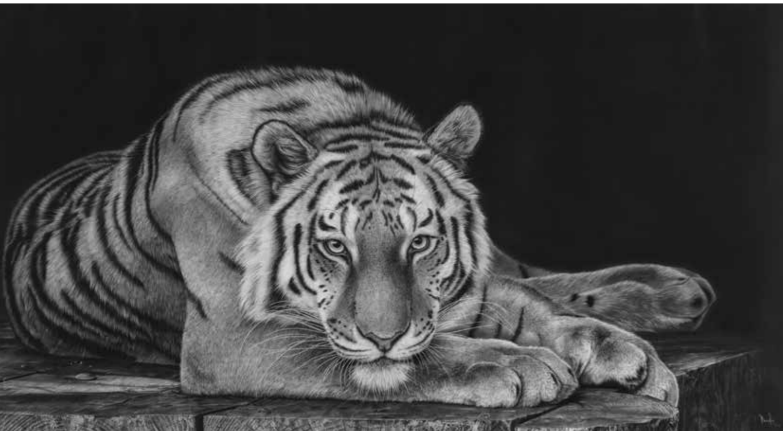
The Courageous Tiger Graphite and charcoal 29 inch (H) X 54 inch (W) 2018